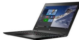
Lenovo ThinkPad Yoga 260 12.5" 2 in 1 Notebook