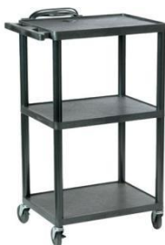
Hamilton Buhl AV Cart

Audio Visual – Items include Interactive Boards, A/V Carts, Camcorders, Cameras, DVD Players, Laminators, MP3s, Projectors, Student Response Systems, Televisions, Visual Presenters and more.