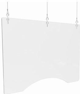
Deflecto ® Hanging Safety Divider With Three Holes Item 2039261