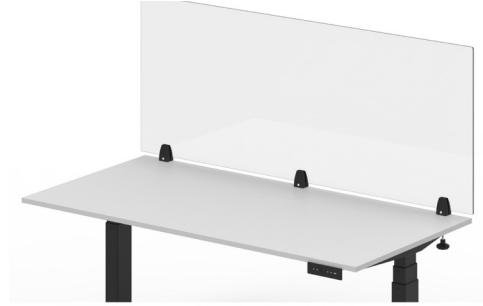
Luxor Reclaim ® Clear Divider With 3 Desk Clamps Item 2040250