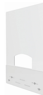
Deflecto ® Mounting Safety Barrier With Pass Through Item 2039272

Questions? Contact your School Specialty Sales Representative today.